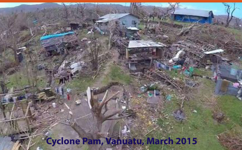
Cyclone Pam, Vanuatu, March 2015

The logistic preparation and response to disasters consumes some 60-80% of the income of NGOs and so, against a background of diminishing funds and rising needs, how can humanitarian logisticians operate more efficiently and effectively?